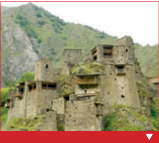
SHATILI – H4 The remote village of Shatili stands as an outstanding and unique example of fortress architecture. Located on the northern slopes of the Greater Caucasus, beyond a high pass, the village is composed of some 60 towers all clustered together to form one large protective building.