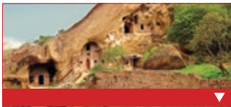
David Gareji (H7) – This grandiose complex of cave monasteries located in the semi-desert just south of Tbilisi, was established in the 6th century. It once housed over 10,000 monks and although it fell into neglect, today it functions as a monastery once more. Set on the top of high cliffs, the caves look out across a

spectacular vista, their walls still covered in striking religious frescos.