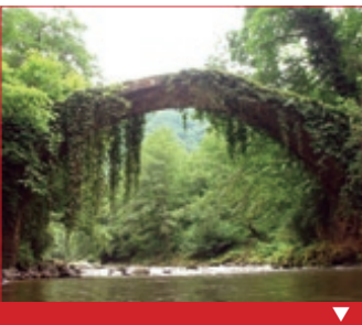
NATIONAL PARKS Nearly 40% of Georgia's territory is still forest. There are more than 40 Protected Areas specially identified for conservation. Borjomi-Kharagauli is the largest National

spectacular vista, their walls still covered in striking religious frescos.