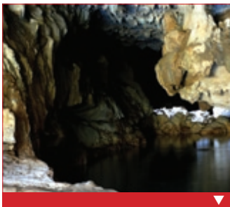
GROTTO – D5 Western Georgia is home to many long, deep karstic caves and some have underground rivers allowing you to have the extraordinary experience of boating in

Park in Europe and is the only member of PAN parks in the Caucasus region.